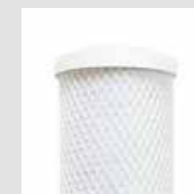
Runs through small filter